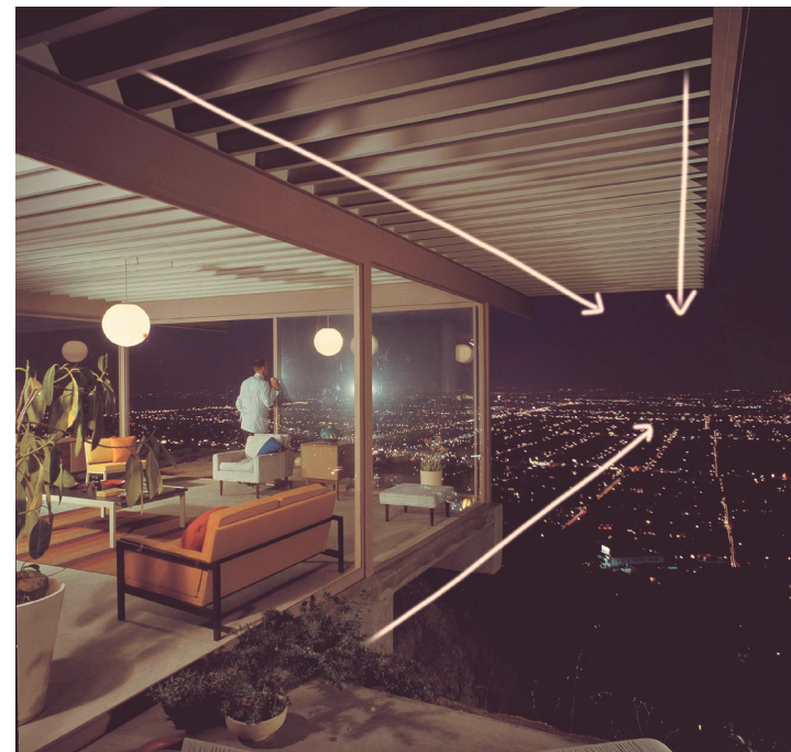
Photographed by Julius Shulman with our annotations.

VIEWS: The floor to ceiling glass windows offer panoramic views of the city below. These views of the LA streets were purposefully designed to align with the steel beam structure of the house.